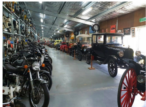
The National Motor Bike Museum

MID NORTH COAST – NSW MANY EXPERIENCES - ONE DESTINATION. See you there!