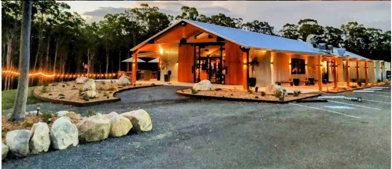
(ABOVE): Farmer's Wife Distillery