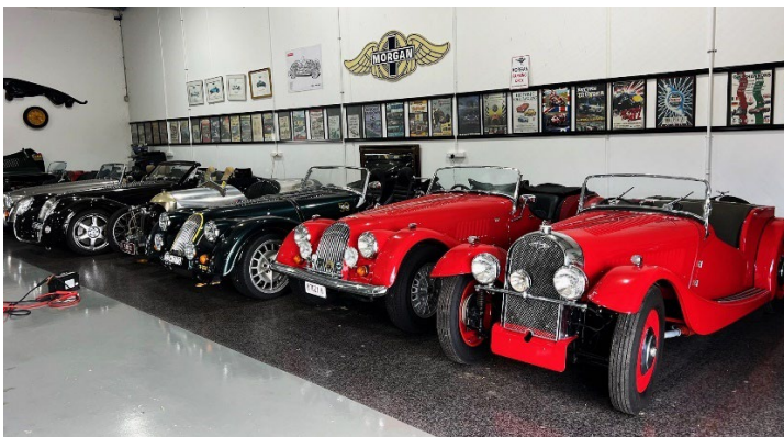
The Chris Page collection